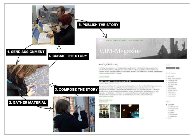
Figure 1. Simplified work process phases with mobile assignments from Study 1 [19].

and might prefer written quotes from interviewees along with captions that are spelled correctly in text form. This approach to the editorial workflow changes the nature of the assignment briefing breaking an assignment down into component parts. In addition, this workflow enables the newsroom to reflect the emerging story by quickly adding rich media (audio, video) elements as the story develops.