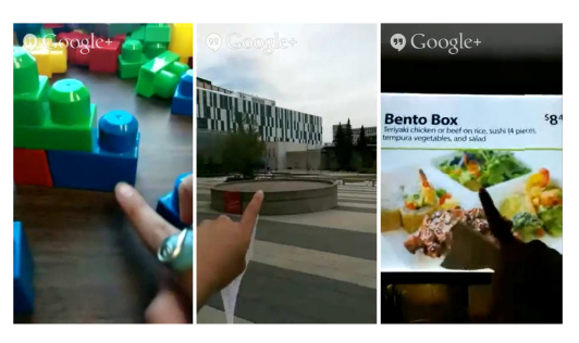
Figure 3: Pointing with hands through the video frame.

MCs would also show new landmarks in relation to other familiar landmarks. There were two strategies that MCs used to accomplish this: anchoring and backtracking . With anchoring , the MC refers to a previously seen (or previously visited) landmark. This was done is a few ways: