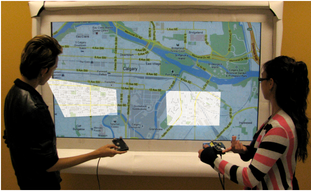
Figure 2: The map application. Two more detailed focus areas (one per user) are projected onto the stationary display. Projections are enhanced due to lighting issues.

projection’s higher pixel density will show its content. This also means that the stationary display becomes (implicitly) the context area to the projection’s focus area. The person on the right hand side in Figure 1 is in this situation. The projected image ‘b’ on the right not only has a higher resolution, but displays added semantic detail because the resolution allows for it. Figure 2 shows our map application in use, where two users are focusing on two map sub-areas by projecting atop of it. The layout application works the same way, but shows details of individual pages.