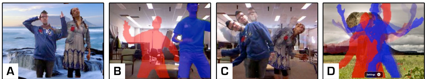
Figure 3. In OneSpace, one can see different visual effects: (a) shows a static background; (b) shows silhouettes; (c) shows traces, and (d) shows a combination of several effects (here: silhouettes, traces, and a static background).

Staging visual interaction. Participants also carefully staged the visual interaction with one another. In many of the fist-fights, people who were “not involved”, would move out of the scene. In other cases, we observed several participants playing “headless horseman” with one another. Here, two people would stand “atop” one another in the scene, with one person leaning his head back, while the other would lean his head forward. The resulting scene would produce a humorous combination “person” with the body of one person, and the head of another. Here, the depth cues allow for interactions that would not be otherwise possible with a chroma-key solution.